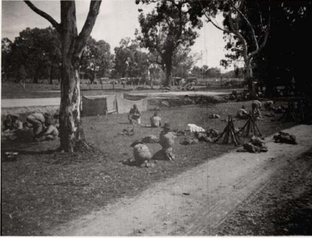
Resting on the March from Wangaratta to Bonegilla

The pictures shown are an example of photos received from members.