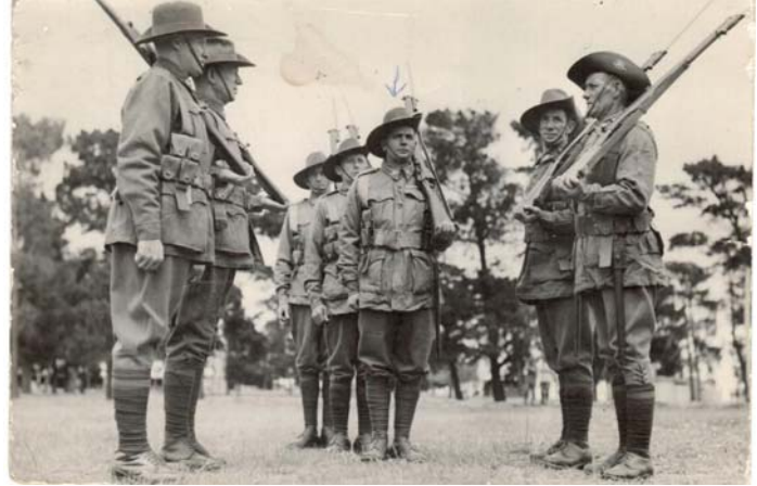
First change of the guard for WW2?